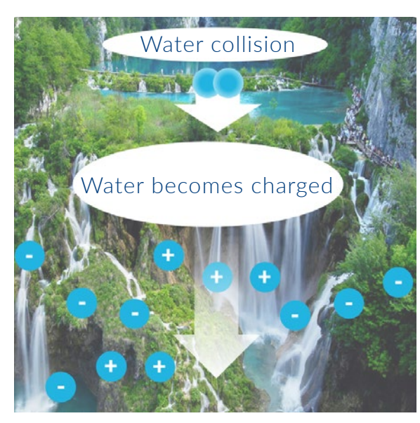
Surrounding air becomes "charged".